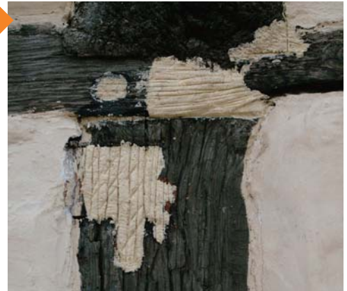
Repairing fractured roof truss tie beam

For localised areas of repair, moulding putty resin mortar can be shaped, sanded, grained and then stained to create a high grade cosmetic finish to match the original. This is a particular benefit with historic property such as old timber framed buildings.